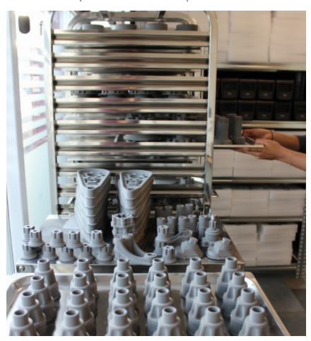
3D printed green parts await sintering at Gullmolar's production facility.

Elliði Hreinsson, Founder of Curio and Gullmolar